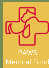
PAWS Medical Fund