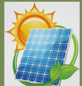
Solar Panel Project